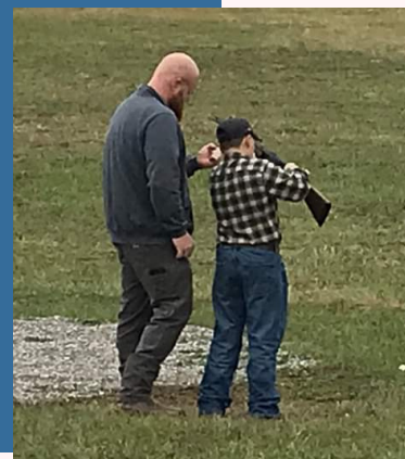
Range practice during Hunter Education

Youth hunter education helps prevent hunting and shooting incidents while improving hunter behavior and compliance with hunting laws. A Hunter Education Course was offered in December which focused on hunter ethics, wildlife conservation and identification, field care of game, first aid, firearm safety, archery and muzzleloading. The day included live range practice at the Clinton County Fairgrounds where all 4-H Shooting Sports activities are held. 46 youth received their Hunter Education Cards as part of the event and are now ready to be safe and responsible outdoors.