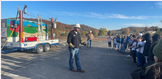
Electrical Safety Demonstration by South Kentucky RECC

Clinton County 4-H partnered with Progressive Insurance and the Middle School to host a Safety Day for 104 fifth grade students. Safety sessions and demonstrations targeted electrical, lawn mower, water, emergency, fire, tool and chainsaw, firearm, internet and cyber, farm, and safety while home alone. 92% of students indicated they learned an important aspect of safety they will use in their own lives.