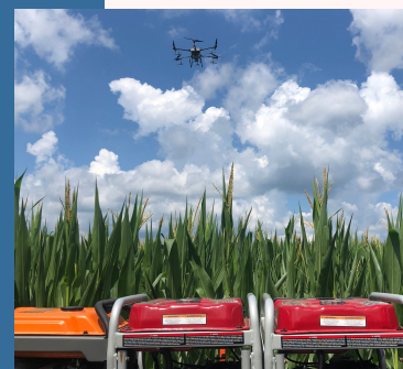
Drone aerial fungicide application

Grain crop producers continually struggle with choices related to fungicide application. Proper application timing is typically at tasseling which can prove difficult without a high clearance sprayer. A corn fungicide trial using drone technology (provided by a new startup company) was implemented at the request of a local grain producer. Clinton and Cumberland County ANR agents designed and flagged the plots while the company used drones to aerially apply fungicides on four replications while four were untreated. Trial results are pending but additional tests for fungicide application are planned. For more information, contact the office.