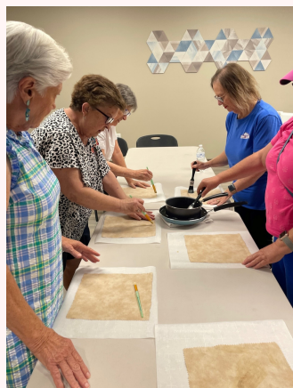
Experimenting with beeswax wraps