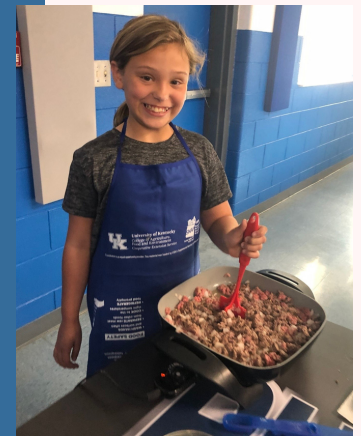
Youth cooking skills in action

Thirteen middle school students completed a five-week afterschool Master Chef Program which included basic cooking skills, food label reading, and making healthy choices when picking snacks or eating out. Students followed recipes and utilized food preparation skills to create healthy meals that were then shared with adults in their families. Adults also gained information about food safety, proper nutrition, and healthy eating on a budget. Quality family meal time was a highlight of the series. 93% of families reported eating more meals at home. 100% of youth participants reported consuming more fruits and vegetables on a daily basis.