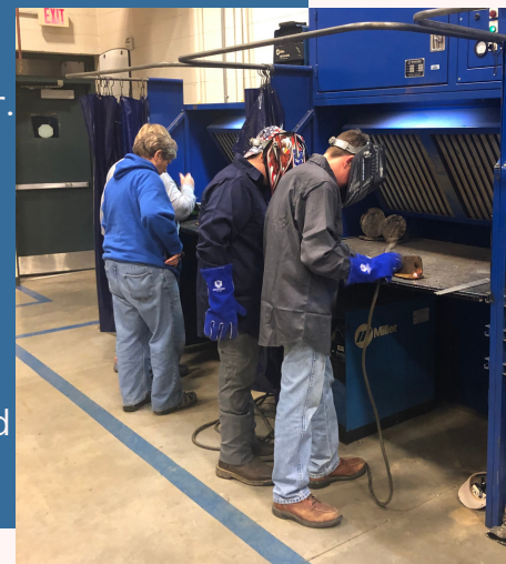
Welders at work

Minor equipment breakdowns can cost producers big money in lost time or repair bills. Local producers identified the need for hands-on basic welding instruction. In response, an eight-week basic welding school held at the Clinton County Area Technology Center under the instruction of the welding technology teacher. 12 producers from Clinton and Cumberland counties participated in the series which enhanced skills in Mig welding, Oxy/Acetylene cutting, plasma cutting, and Oxy fuel cutting. Evaluations revealed that 100% of participants plan to attempt small on-farm repair jobs that require welding. Due to the success of the series, 91% indicated interest in an advanced class which is being planned for spring 2023.